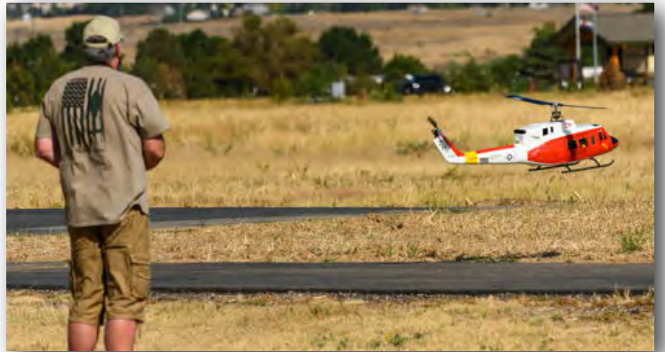
Patrick's RobanBell 212 in red/white Navy livery.