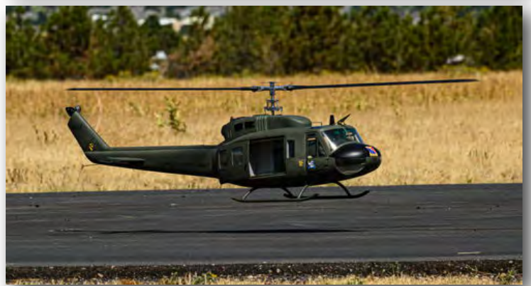
Patrick Vestal flying his 800 size Bell 205 UH-1D Huey