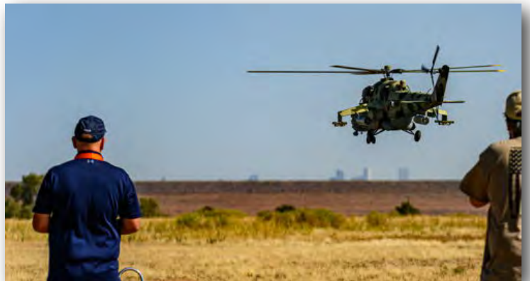
attack helicopter. Powered by a Pahl turbine it weighs about 62lbs, has a 2.5 meter rotor diameter and is a 1/6.7 scale model built by Heli Classics of Germany.