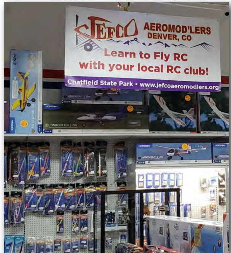
The Jefco Aeromod'lers Learn to Fly banner hanging in the Littleton HobbyTown hobby shop, 7981 S Broadway.

Last but not least, Covid: It is still rearing its ugly head and we are adapting. Signs have been placed at the field to remind us that social distancing is still very important and should be adhered to. Nobody likes wearing a mask, but please do your part to help prevent the spread and put one on. Be patient, this too shall pass.