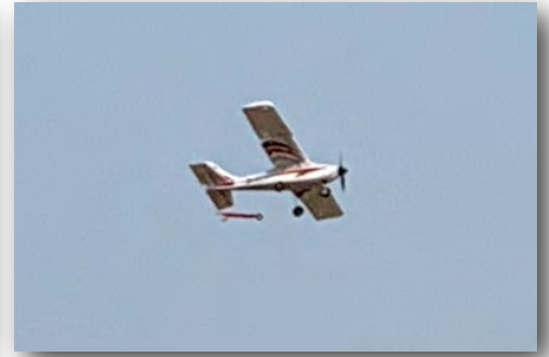
Washer just released.