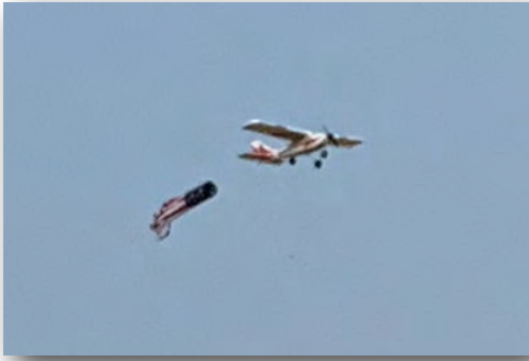
Opening fly-by, Bud's Apprentice towing banner.