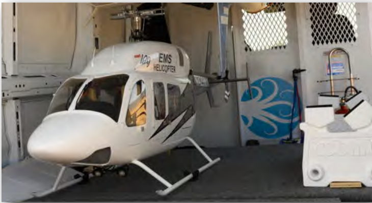
Michael Kranitz's Vario 1/5 scale Bell 429. It weighs 48 lbs and is powered by a Jakadofsky Pro 5000 turbine.