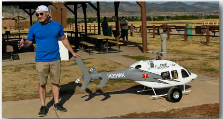
It's 7.5 feet long and has a 2.3 meter rotor disk with aluminum blades. It has actual blue/red police strobes.