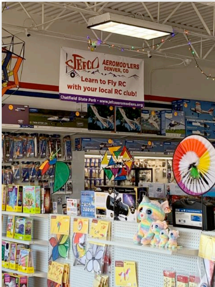
The Jefco Aeromod'lers learn to fly banner hanging in the Littleton HobbyTown hobby shop, 7981 S Broadway