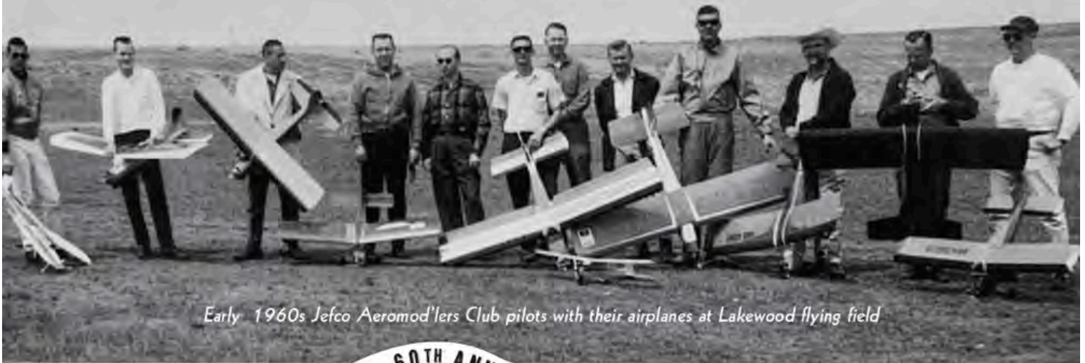
Early 1960s Jefco Aeromod'lers Club pilots with their airplanes at Lakewood flying field

... a beautiful, 40-page, high quality, hardcover coffee-table book that captures the untold stories about the people and places of flying club #176, one of the earliest chartered clubs among the Academy of Model Aeronautics (AMA) over 2,500 member clubs.