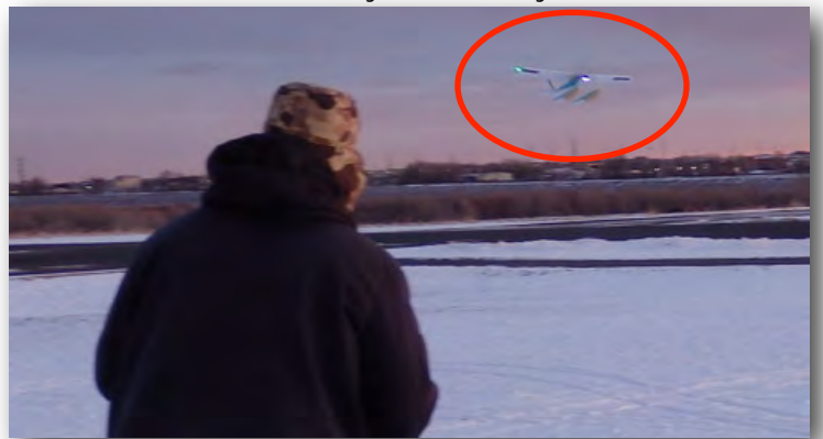
Bud makes a low pass as well