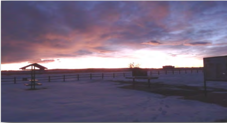
It was a beautiful sunrise.