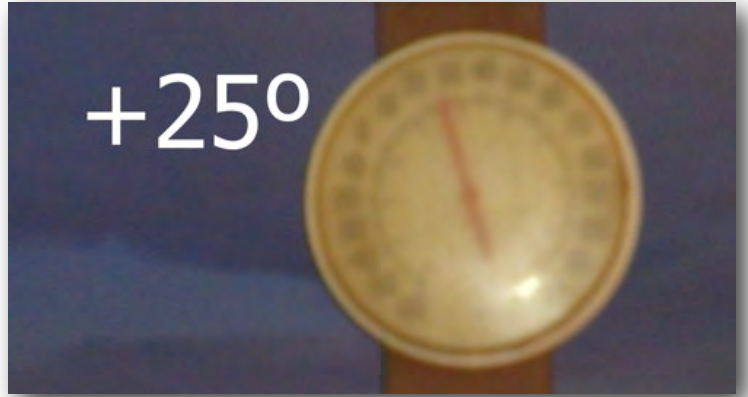
The temperature was a balmy 25 degrees