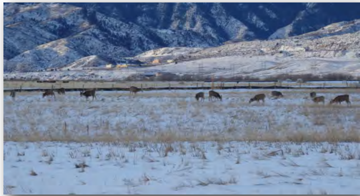
Herd of deer just south of the aerodrome driveway