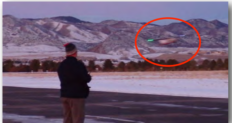
Peter Thompson performs a low pass Note how dry the runways were