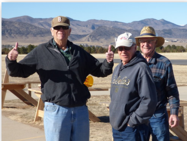
How's the weather?