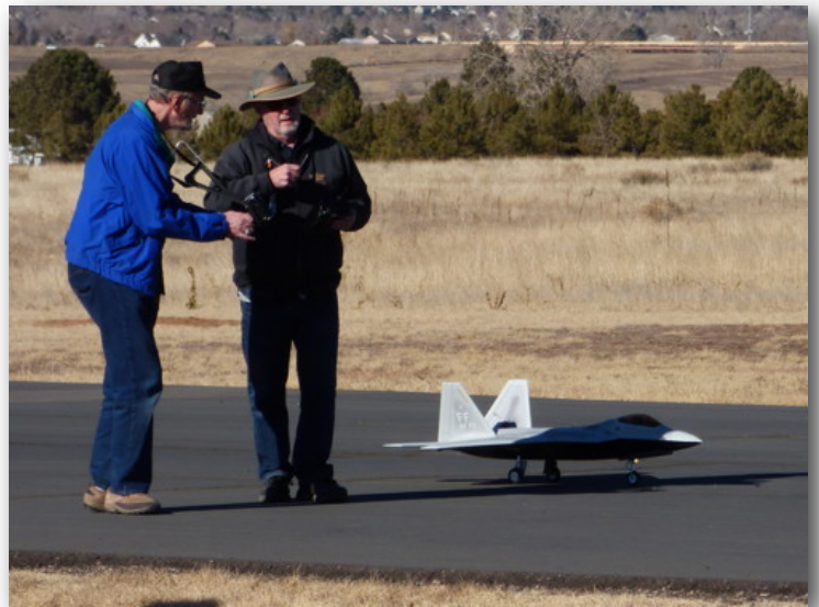
Transmitter and Camera at the ready.