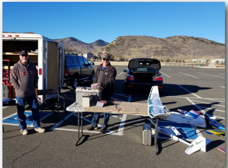
The weather was great at Dakota Ridge too!