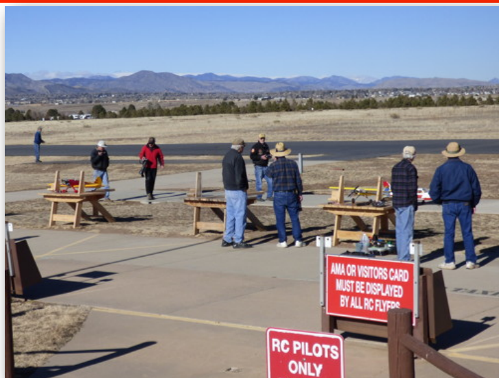
Looking Northwest from the pilot's entrance.