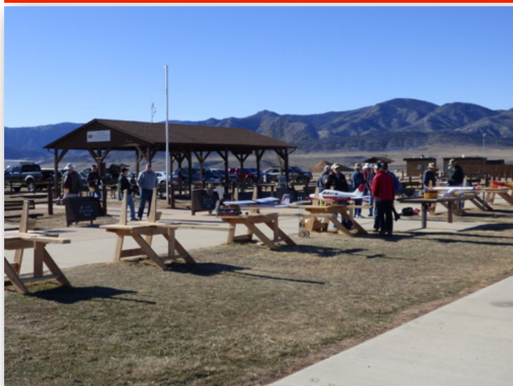
Looking Southwest towards the pits and pavilion.