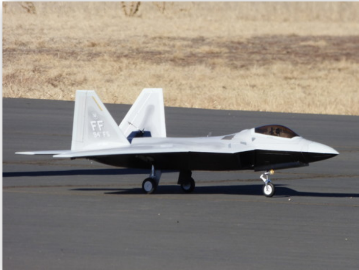
Raptor takeoff roll.