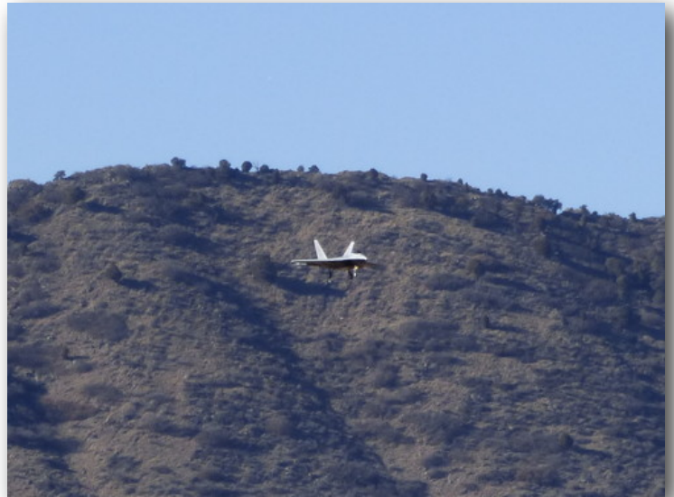
Raptor lined up for the landing.