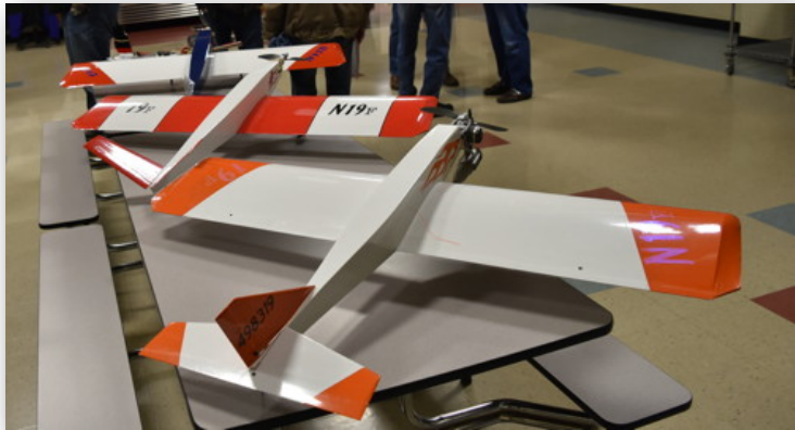
Craig Farthing brought 3 Scat Cats, one with a "V" tail.