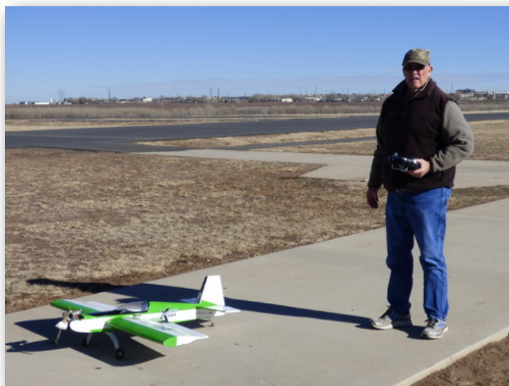
Back to the pits after a successful flight.