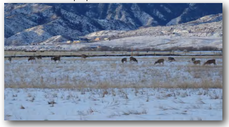
Herd of deer just south of the aerodrome driveway