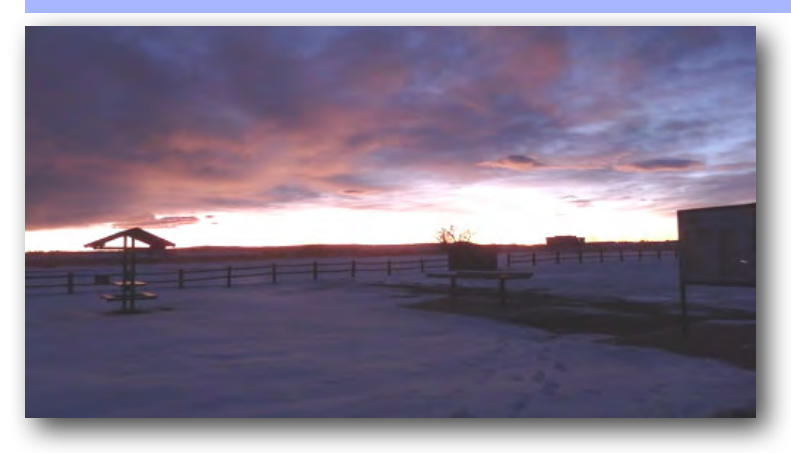
It was a beautiful sunrise.