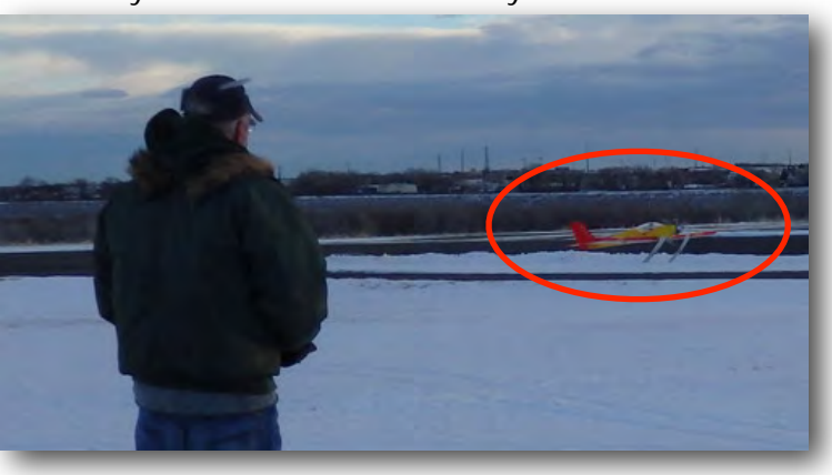
Bruce Ream performs a low pass