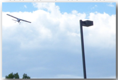
Craig coming in for a landing.