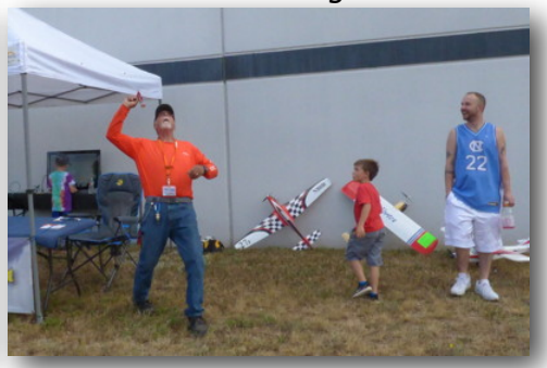
One big kid!