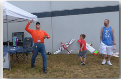
One big kid!