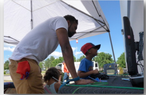
Dad and Son at the flight simulator.