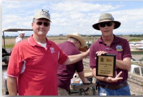
Team Award, Denver RC Eagles