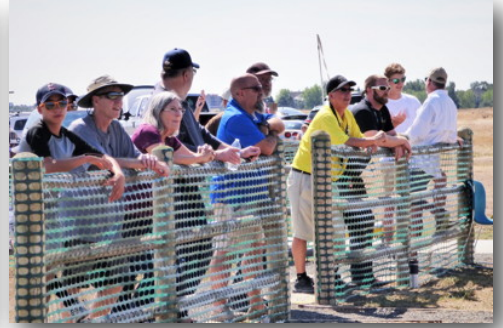
Lots of spectators