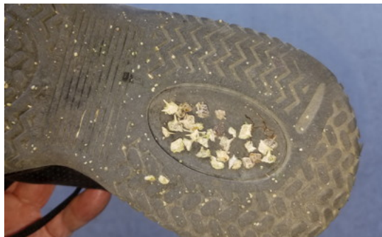
A consequence of the The Great Goat Head Cleanup , P. 11