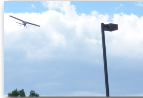
Craig coming in for a landing.