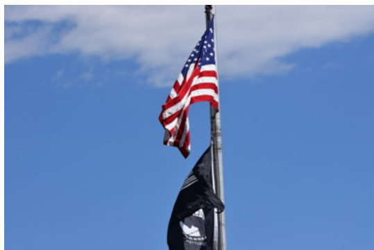
Old Glory and the POW/MIA flag flying above the 2019 Warbirds & Classics Over Denver event.