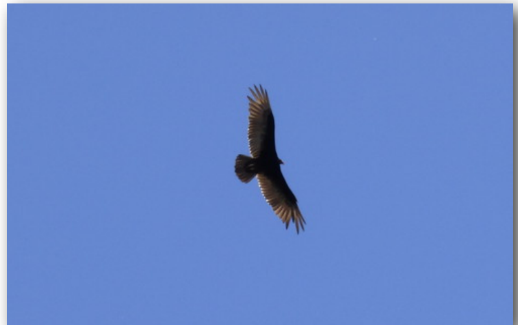
An overhead visitor keeps an eye on the Fast 'n Slow Fun-Fly activities.