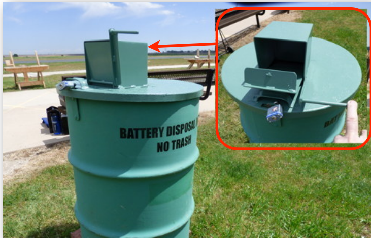
The new battery disposal barrel. Read the Business Meeting minutes describing its operation and use.

From what I have observed lately everyone is playing nice together. However if anyone has any concerns please give me a call or email at roncory3@hotmail.com . happy contrails