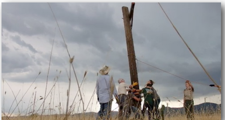
Turning the crossarm broadside to the aerodrome.