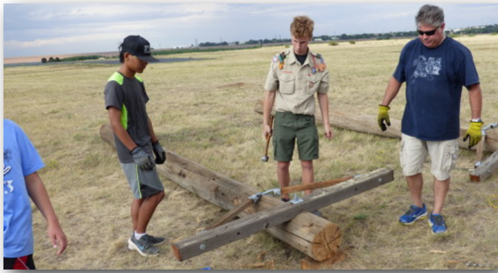
One perch ready to go!