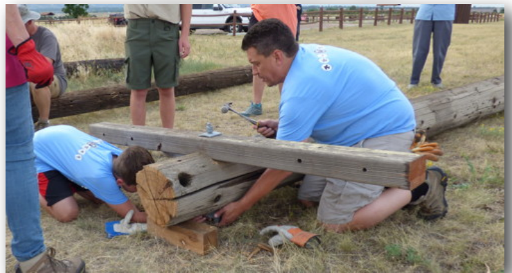
Bolting crossarm onto pole in the notch.