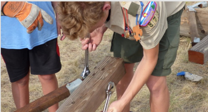
Tightening crossarm brace to crossarm.