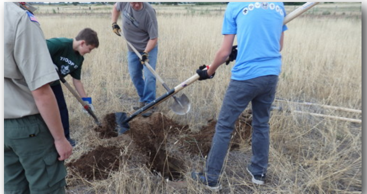
Preparing the hole to receive the pole.