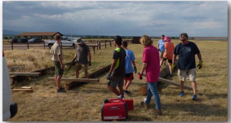
Poles and arms laid out ready to start.