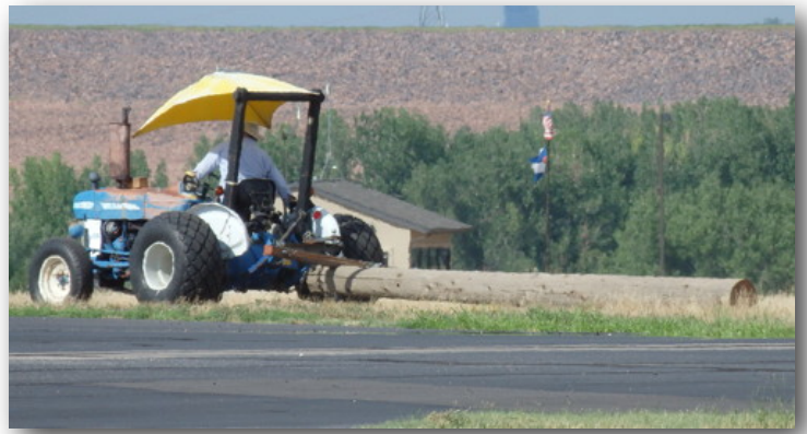
Dragging a perch to a hole.