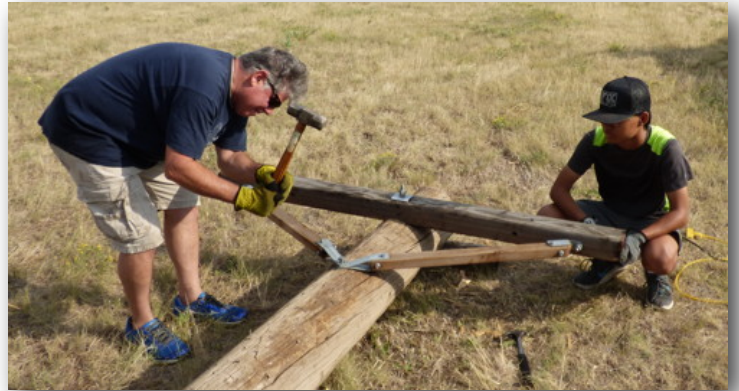
Driving crossarm brace bolt into pole.