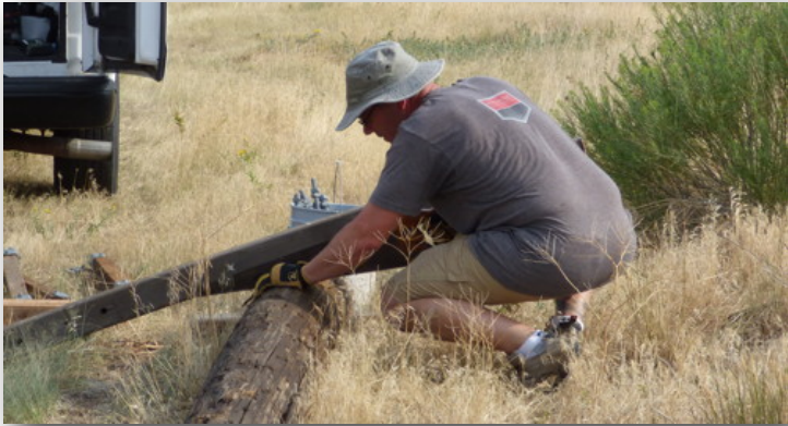
Sawing crossarm notch in pole.