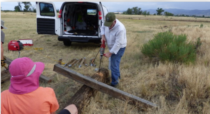
Drilling crossarm mounting bolt hole.