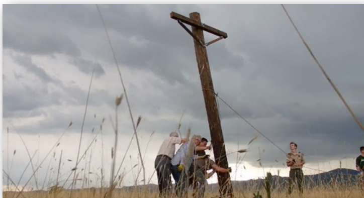
The pole drops in!