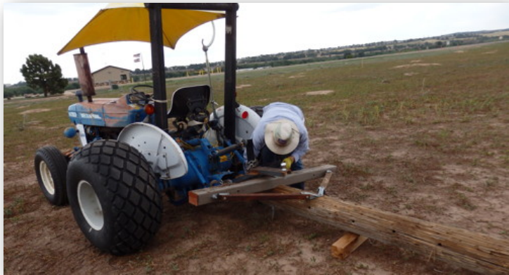
Dropping the perch near the hole.