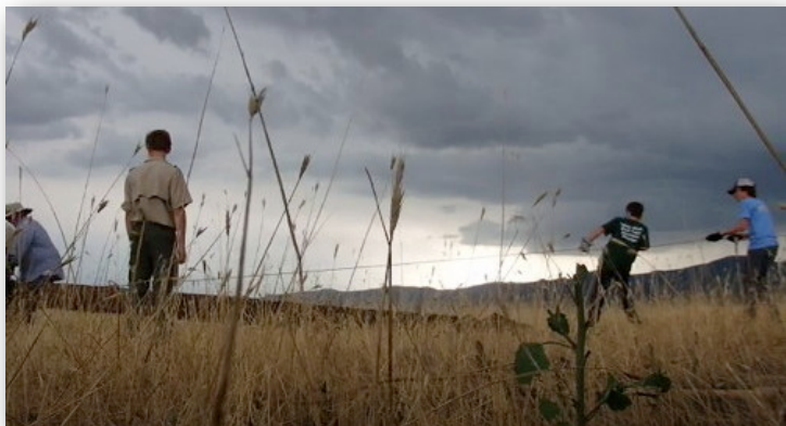
Preparing to raise pole and drop into hole.