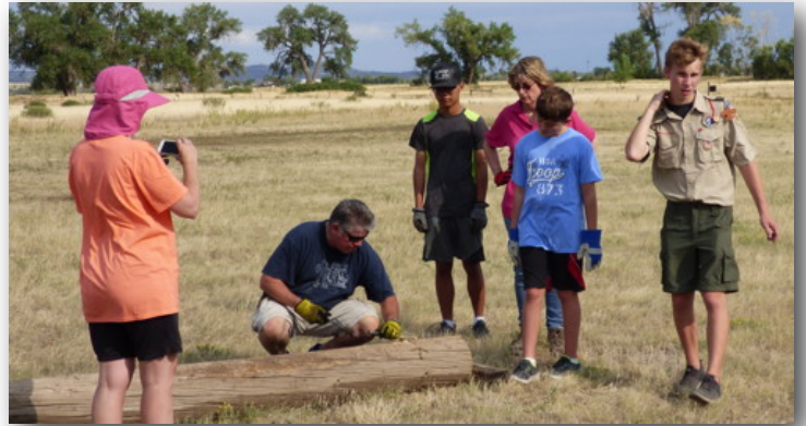
Chiseling out crossarm notch.