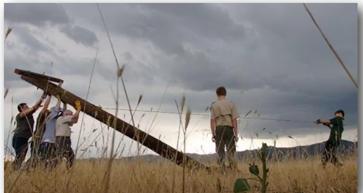
Up she goes.