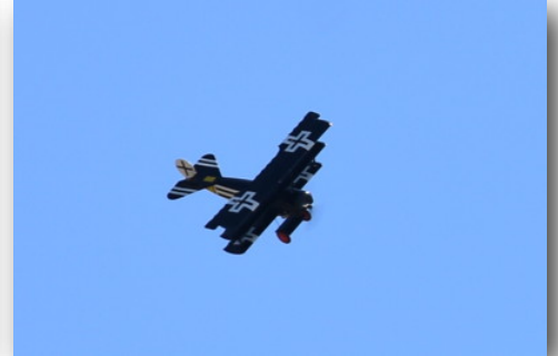
In the air