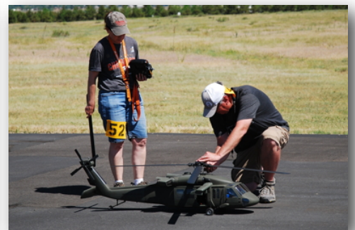
Working on rotor