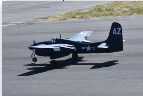
Touchdown on mains