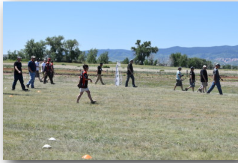
Walking the Course