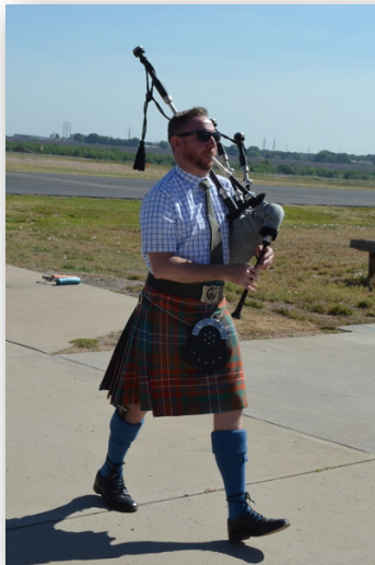
The Lone Piper begins the ceremony.