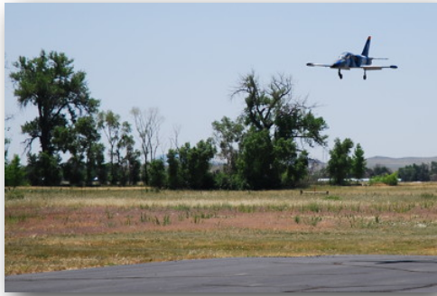
Coming in for landing