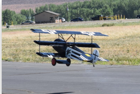
WWI Triplane takes off