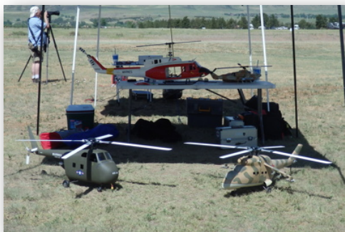
A bevy of helicopters