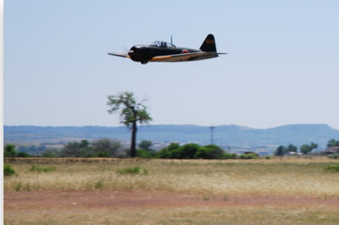
A Zero on a low pass