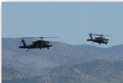
Formation 8 Flying