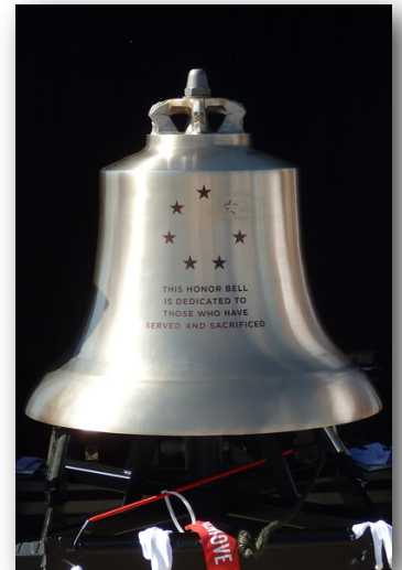
The Honor Bell tolls in memory of veterans.