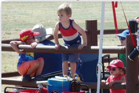
The tiniest spectators