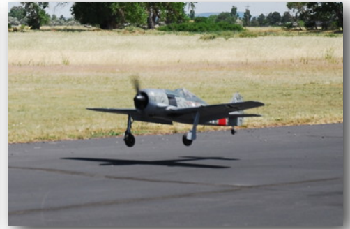
And yet another