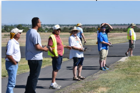
On the flight line