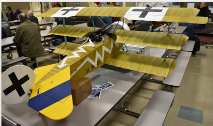
Bruce Ream's Beautiful Fokker DR-1. Right, the engine detail. More to follow on the next page.