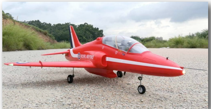
Terry Hock's FreeWing 6s Hawk T-1 Red Arrow Motion RC