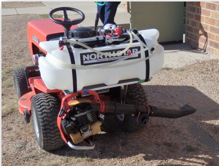
Detail of the sprayer and blower attachments.