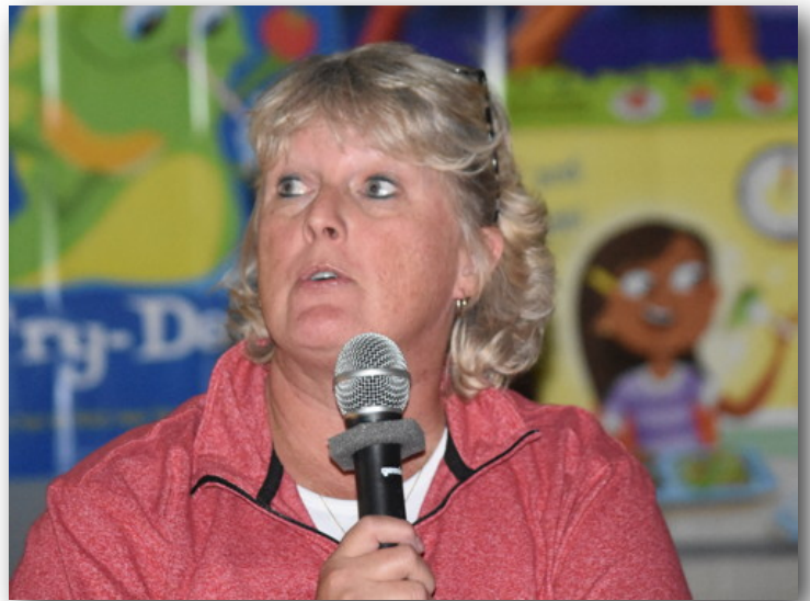
Lora went into great detail. Please refer to the minutes.