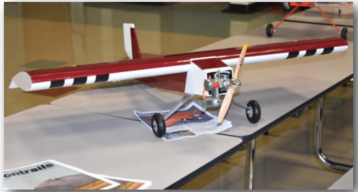
Bill Neyman's RC Model World plans built Swizzle Stick.