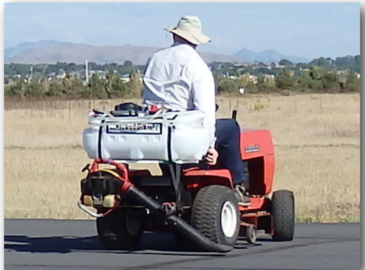
The blower is mounted at the perfect height.