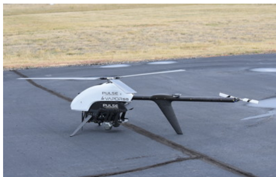
The Pulse Aerospace Vapor 55