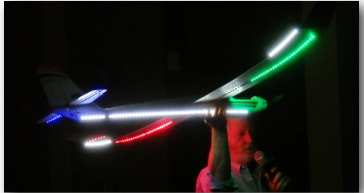
The many lights are required for proper orientation