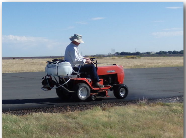
The spray container holds plenty of liquid so Bud won't have to make multiple trips to refill.