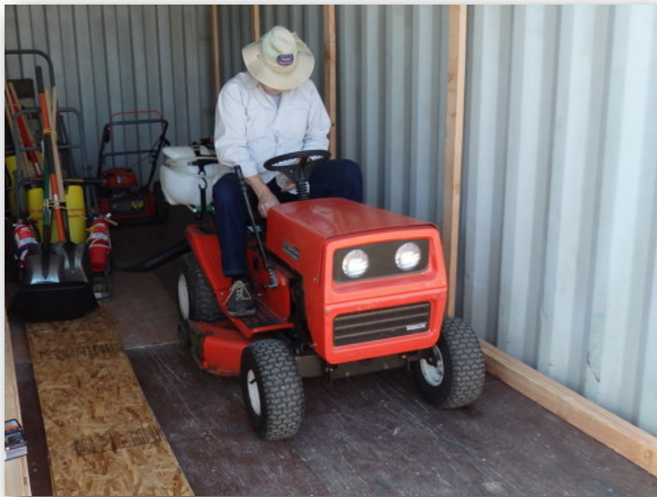
The tractor fits just fine inside the storage container.