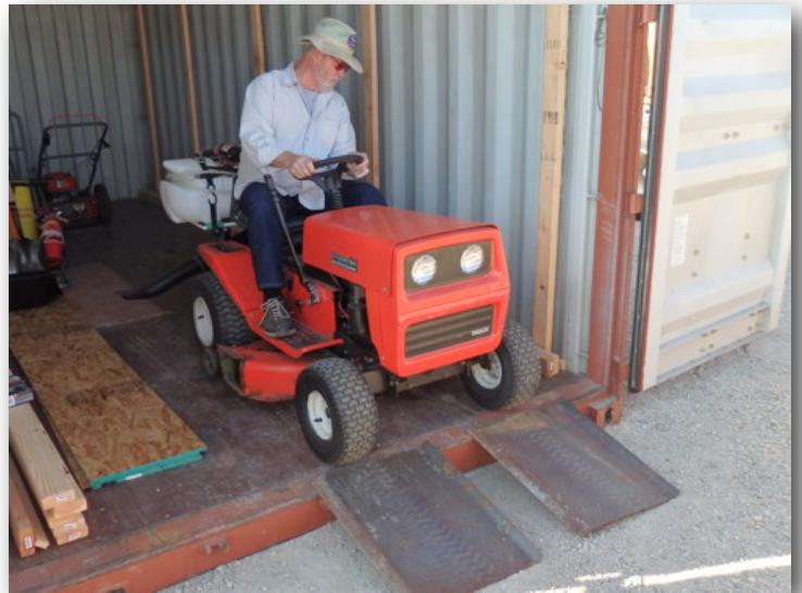
Short ramps make ingress and egress easy.