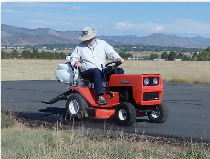
The spray head can be fixed as shown on the cover picture, or hand held to pinpoint the target.