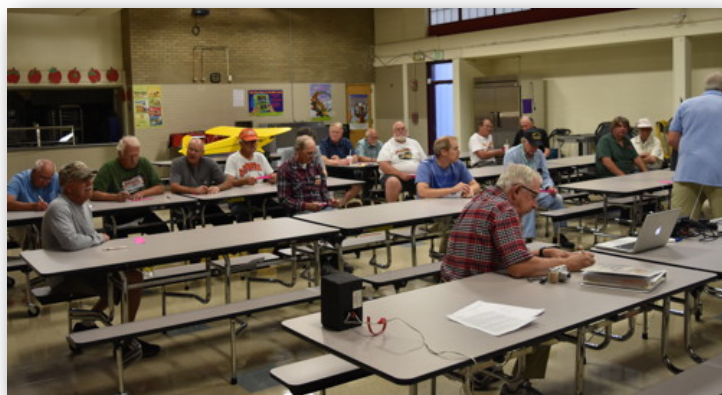
Preparing for the drawing.