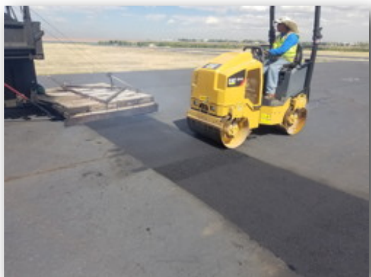
Runway repair at the Chatfield Aerodrome.