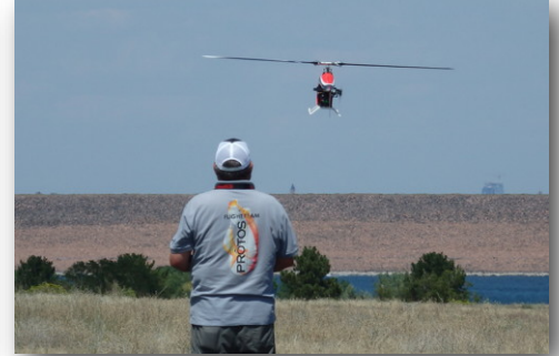
And away we go