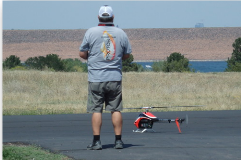
Spool her up