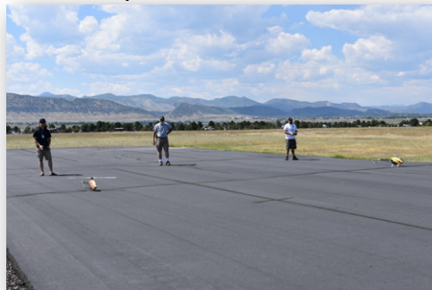
Setup for the drag race