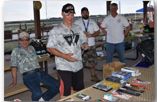
Prizes, prizes, prizes