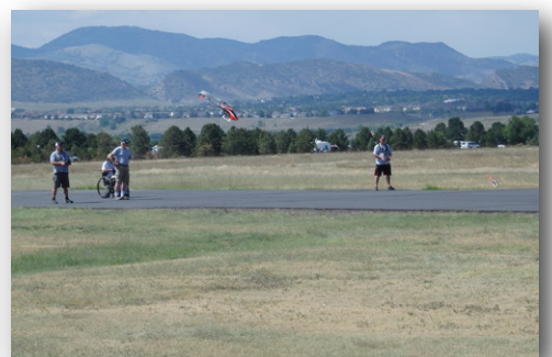
They're off again