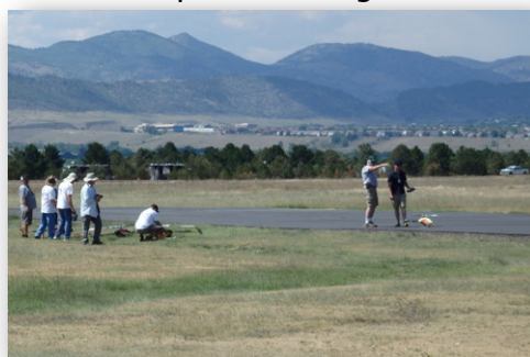
Setting up 10