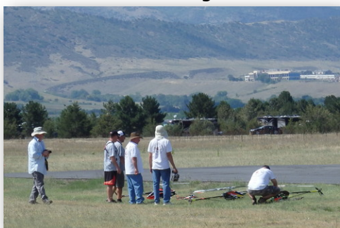
On deck for the drag races