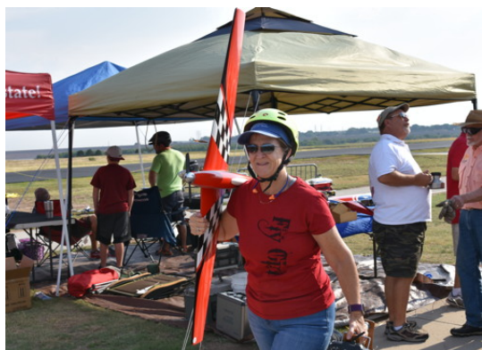
A pylon pilot with her plane and radio.