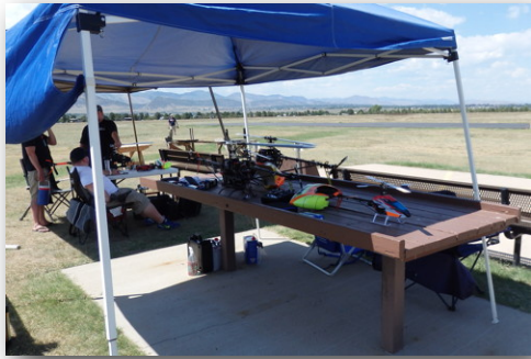
Heli's in shade