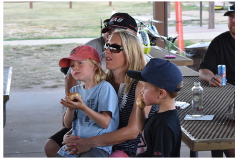
Its a family affair