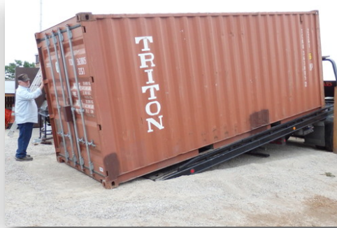
Bud signals OK to drop it