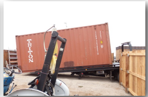
Lowering into place