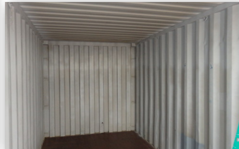
Pretty darn clean inside