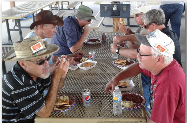
As a friend used to say "this is Gracious Gutwadding".