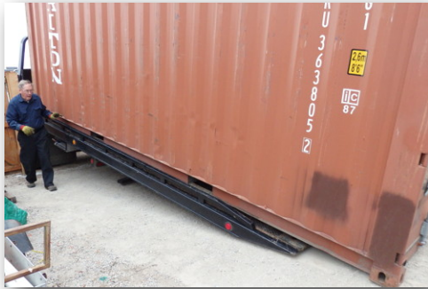
Operator checks placement