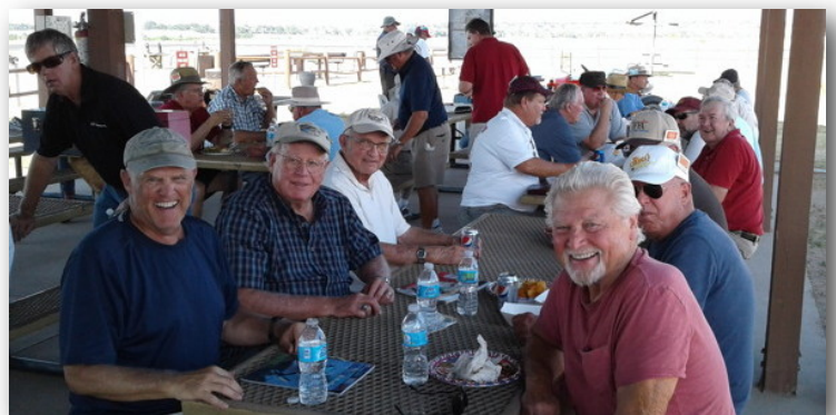
Everyone was all smiles after this feast!

Nominations will the August for the 2017 - Directors