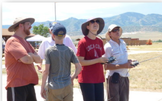
Pilot Box at the Ranger Fun-Fly