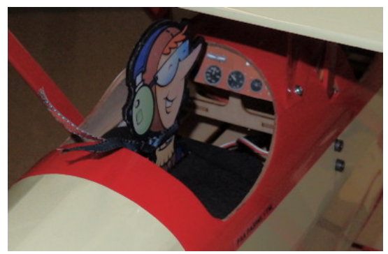
Cockpit detail of Bud Glass' Pietenpol