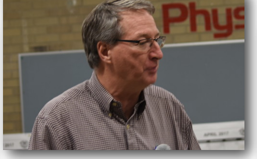
Left, Right and Below, Drawing Winners!