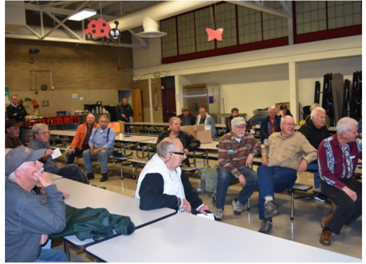
It is starting to thin out.