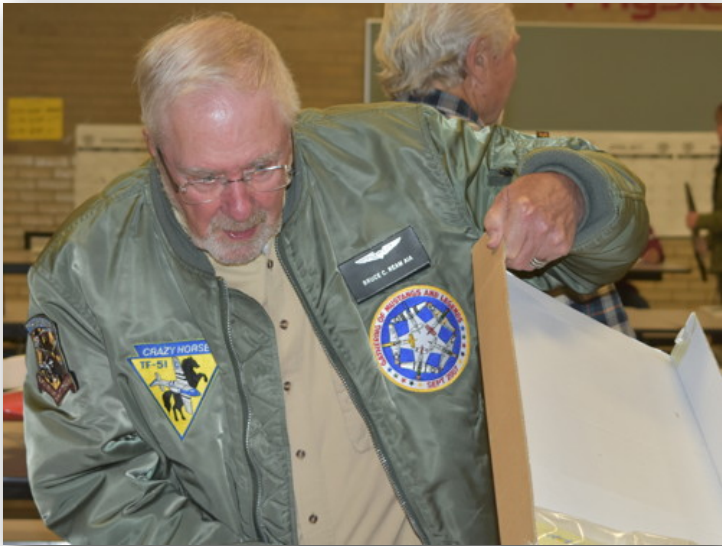
There was so much stuff to inspect!