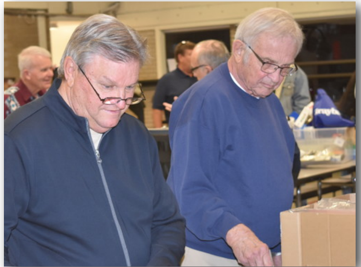
This had to be one of our largest mini-auctions ever.