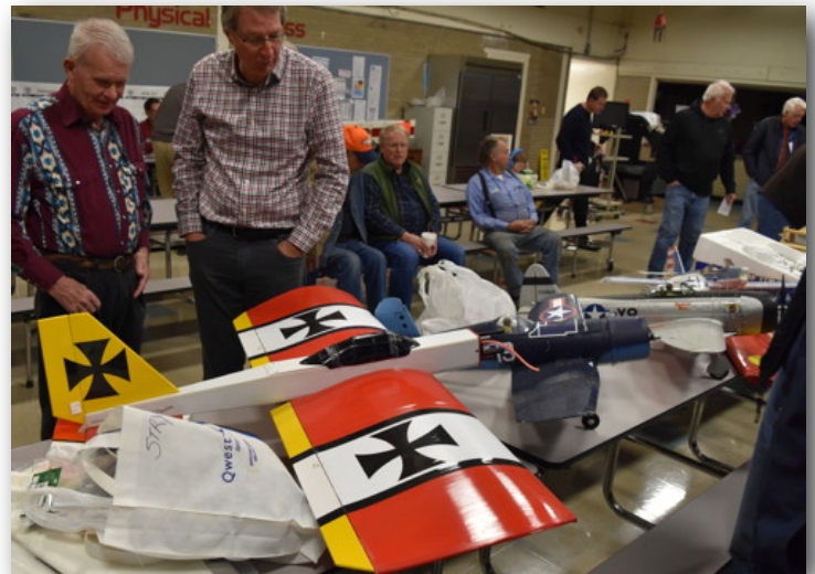
There was a lot to see and buy at the Mini-Auction. Pictures start on Page 6