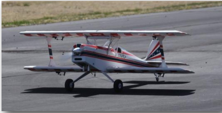
Start the Take-off Roll