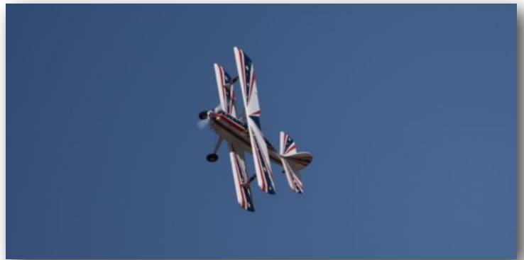
Left Bank for Turn