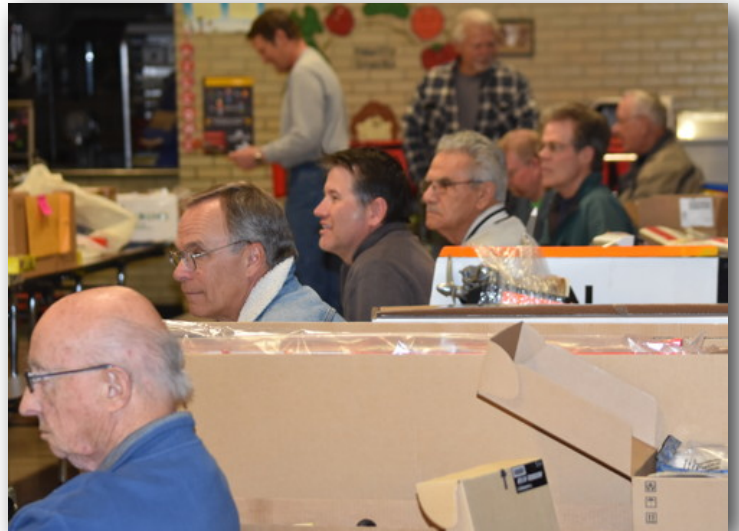
Almost as much stuff as people!