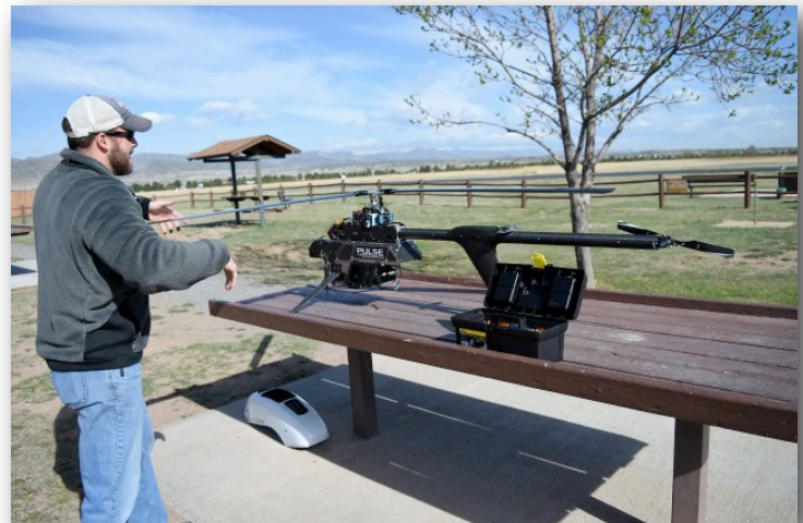
A very expensive Helicopter. Article on Page 10

NOTE THE CHANGE IN BUSINESS MEETING DATE AND DAY IN MAY! THE MAY MEETING WILL BE HELD ON TUESDAY, MAY 2nd DUE TO A SCHOOL DISTRICT SCHEDULING CONFLICT!