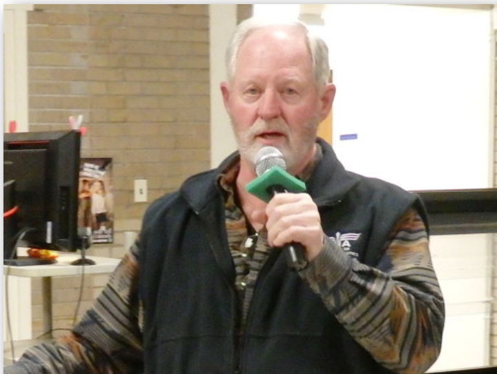
Bud Glass took many, many photos.