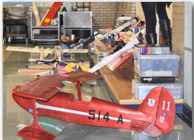
Part of the items auctioned and sorted for pickup.