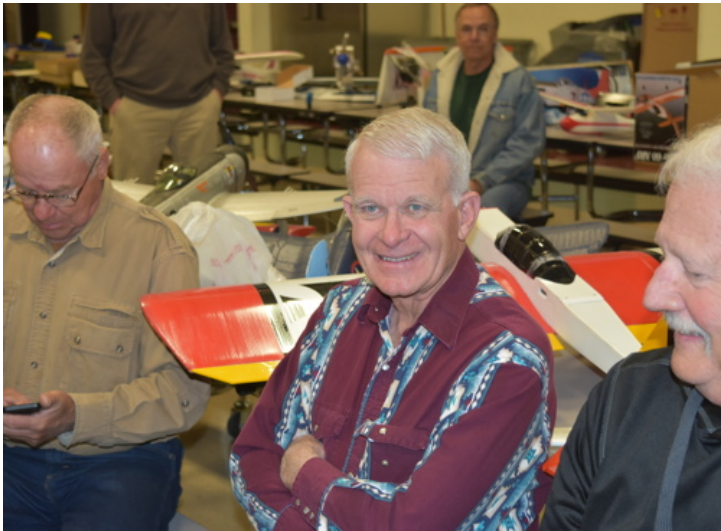
Awaiting the Mini-Auction to start.