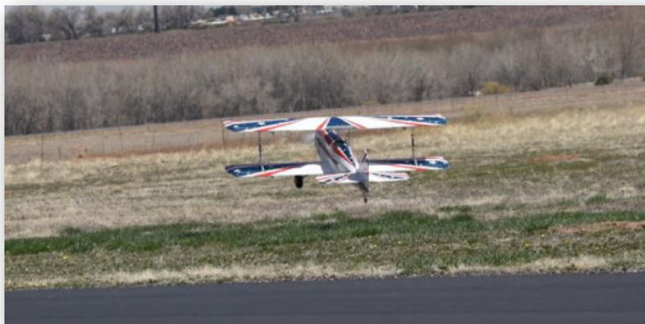
And She is Airborn!