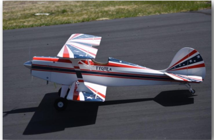
The Maiden Flight of Larry Bickel's Biplane "Tequila" Pictures on Page 9