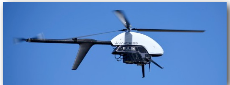
Hi-Tech Helicopter - see article on page 10