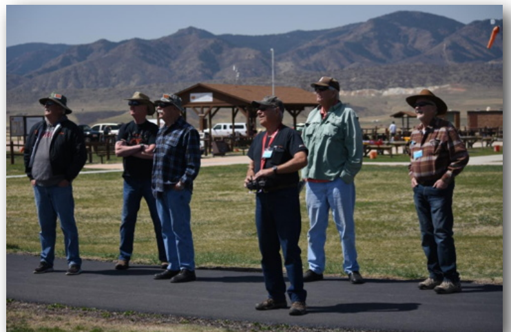
No Lack of Volunteer Spotters!