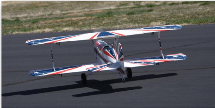
Tail Wheel Up