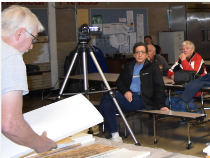
Getting ready to press the wings for final curing.