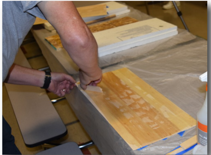
Spreading the Gorilla Glue into a very thin layer.