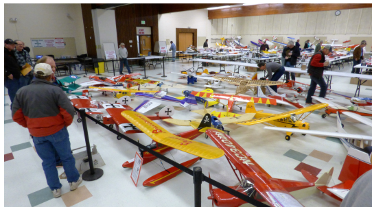
The large plane area at the Jefco Aeromod'lers Auction held at the end of January.